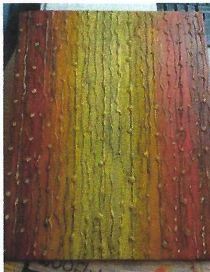
Glue Painting – Instructions by Amy Scheg